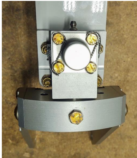
Figure 2 Rear