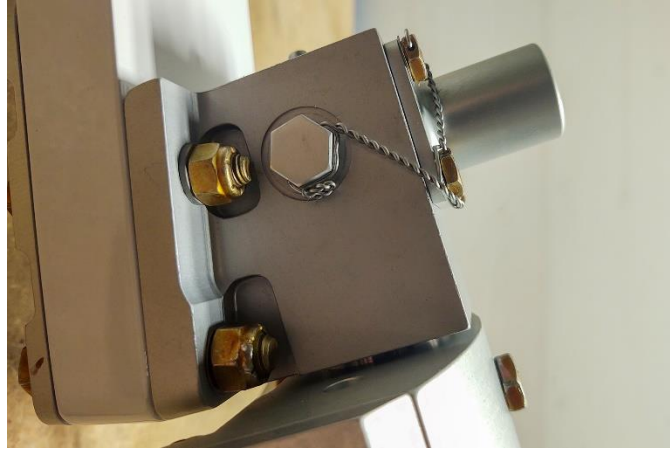
Figure 1 Left Hand Side

Affected assembly area, showing an example installation: